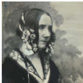
Ada Lovelace (1815 – 1852) Pioneer of computer programming

Alan Turing, Gödel and others formalize the "algorithm" as the core concept of computation.