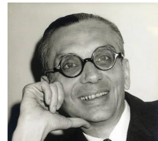
Kurt Gödel (1906 – 1978) Algorithm Complexities