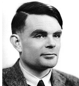
Alan Turing (1912 – 1954) Formulating Turing Machine